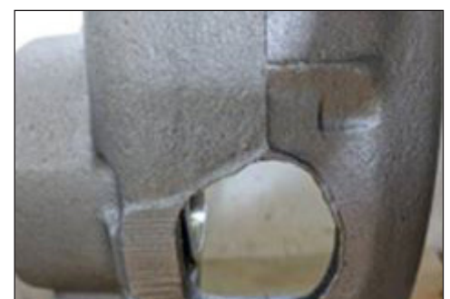
With Metal Guard 560